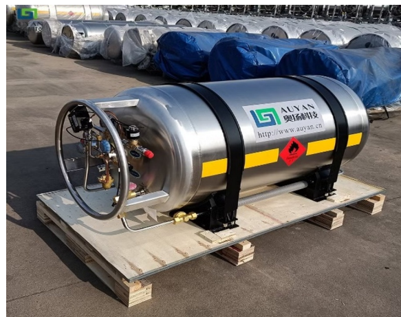
Fig. 1 Cryogenic LNG Cylinders Vehicle Nitrogen LNG Storage Tank Gas Cylinder for Truck [22]

The design of LNG cryogenic tanks for heavy commercial vehicles involves addressing several technical challenges, including optimizing tank geometry for maximum fuel storage capacity, selecting lightweight yet durable materials to reduce vehicle weight, and ensuring thermal insulation to minimize heat ingress as shown in Fig. 1.