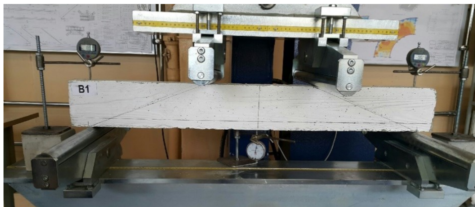
Fig. 1. Test bench for experimental beams.

Analysis of the destruction of the experimental beams showed that the destruction of the unreinforced beam occurred along the normal section in the clean zone as a result of plastic deformations in the tensile zone of the reinforcement at a load of 19.46 kN. The destruction of the reinforced beam B2 occurred along an inclined section at a load of 24.69 kN, beams B3, B4 and B5 along normal sections due to crushing of concrete in the compressed zone, at a load of 26.2 kN; 22.57kN; 26.91 kN, respectively (Fig. 2).