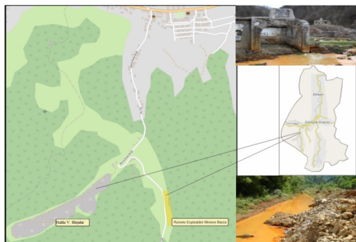
Fig. 1. Location of the Barza mine.

The Barza mining perimeter, which from an administrative point of view belongs to the National Company of Copper, Gold and Iron „MINVEST” S.A. Deva, is located in the Ore Mountains on the territory of Crișcior commune, Hunedoara County. In the Barza mining operation, activities were carried out for the underground extraction of gold and silver ores. The mining activity ended in 2006, and the Barza mine entered an extensive closure process. The tailings resulting from the underground mining works at the Barza mine were deposited in the Blojului Valley dump, at approx. 3 km away (Figure 1) [4].