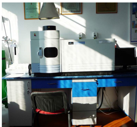
Fig. 2. ICP-OES spectrometer.

Street dust samples were taken from three different urban locations, low-traffic streets, high-traffic streets, parks area, residential and industrial areas in Petroșani, Petrila Vulcan, as well as one soil sample collected from Petrosani area, in order to establish background concentrations. Samples were analyzed for As, Co, Cr, Cu, Mn, Ni, Pb, Zn, Ti, Fe using the inductively coupled plasma atomic emission (ICP OES) spectrophotometric technique (Figure 2).