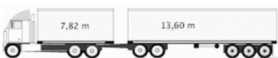
Fig. 4. EMS - 25,25 m long [20].

Based on the data obtained from a transport company, the cost of transporting 1 pallet on this route was calculated for each of the above sets of vehicles. The following data was used for the calculations: