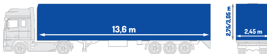
Fig. 2. Standard set - 16,5 m long [19].