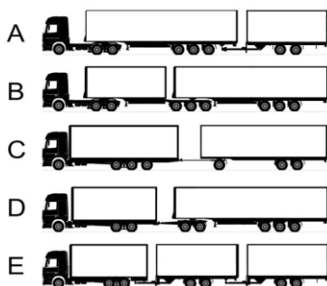
Fig. 1. Modular systems combinations [16].

European Modular Systems used in Europe and worldwide have recently become very popular and this seems to be justified by the ever increasing volume of goods being transported. As the demand for road transport services continues to grow and longer distances are being covered, many countries are allowing for derogations from the Directive admitting longer vehicles for use in their territory.