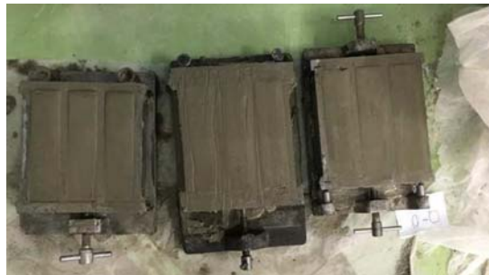
Fig. 1 Samples prepared in the tripartite moulds for the compressive strength testing.

Samples for the compressive strength and shrinkage measurements were made according to the standard recommendations [30-32]. The test samples were made in the tripartite moulds, each chamber has internal dimensions of 160 x 40 x 40 mm. The moulds were lubricated inside with a layer of a non-reactive anti-adhesive agent which prevents the paste from sticking during binding process and facilitates the demoulding of samples. The moulds were then filled with the paste a few mm above half their height and the first compaction was performed. After the samples were thoroughly vibrated, the moulds were filled in the entire volume. The excess mixture was removed with a steel trowel. The second compaction was then performed. Both compaction cycles were performed on the SWE-08 vibrating table with a vibration frequency of 52.7 Hz and a vibration amplitude of 0.67 mm. The compaction of each layer lasted about 30 s. The samples prepared in this way were left to bind in the moulds under laboratory conditions – temperature 20^{\circ}\text{C} \pm 2^{\circ}\text{C} . They were protected against water loss. Next, the samples were demoulded and labeled. The samples for the compressive strength testing were demoulded after 4 h, 8 h, and 12 h and the remaining ones after 16 h and they were placed in a water bath.