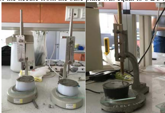
Fig. 4, Fig. 5 Testing the beginning and end of the setting time.

10 mm from the previous measurement site. Between the tests, samples were placed in a climatic chamber. The time, referred to as the beginning of the setting time, was determined when the distance of the needle from the base plate was equal to 6 \pm 3 mm.