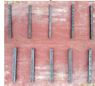
Fig. 2. The experimental squared rebars after rust removal.

The accelerated corrosion experiments included ten specimens and all the squared rebars were collected from abandoned components of the historical RC buildings in China. All the rebars were undeformed and the surface rust was removed by polishing, which is shown in Fig. 2. The widths of the rebars included 16mm and 22mm. According to the historic book [10], the contents and volume ratios were Cement: Sand: Stone (Coarse aggregate) = 1: 2: 4, and the water was accounted for 10% ~13% weight of all contents. The aimed compressive strength of the concrete specimens after 28-day curing was 15 MPa [6, 8], and the averaged compressive strength (three specimens) of the standard 150mm cube was 15.6MPa after curing. The dimension of the specimens was 150mm×200mm×150mm, and the steel rebar was a little longer than the width of the concrete specimen for the manufacture of the specimens. The general design depth of concrete cover at that period was 38mm [10], and the cover depths for the specimens were 36mm, 38mm, 40mm, 42mm and 44mm. The dimension and the diagrammatic sketch of the specimen are shown by Fig. 3.