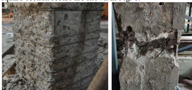
Fig. 1. The square-section rebars form historical RC buildings.

The corrosion of the steel rebar within concrete is one of the major deterioration problems for the durability of reinforced concrete structures [1]. For the evaluation of durability, the time for the repair and maintenance for the reinforced concrete (RC) structures is usually determined by the appearance of the corrosion-induced cover cracking. Many studies have proposed calculation models to predict the time of crack initiation, including laboratory tests and on-site investigations [1-3] and theoretical models [4, 5]. However, all of these experiments and prediction models were for round-section rebars, and there is no prediction model for square-section rebar case. Actually, the square-section rebars were widely used for RC buildings in China from 1912 to 1949 [6], and the majority of the RC buildings had been listed as protective historical buildings. The square-section and round-section are mechanically different, and thus the existed theoretical models and calculation models are not suitable for these building that using the square-section rebars. The suitable calculation method for the service life of this kind of RC structure is urgently demanded and necessary. The type of square-section rebars are shown in Fig. 1.