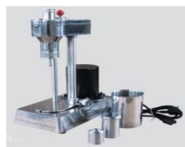
Fig. 2. Viscometer.

Mix 5% bentonite (Wt./Vol.) and 0.25% sodium carbonate (Wt./Vol.) with water in specific mud cup, stirring with high speed for 20 min, then stewing at room temperature for 24 h.