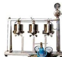
Fig. 3. Filtration press.