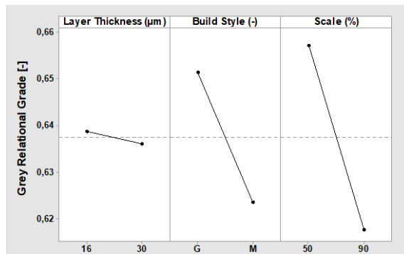
Fig. 3. Plot of means for grey relational grade results.

In this investigation, Analysis of Variance (ANOVA) is utilized to identify the process parameters that exhibit significant effect on the dimensional accuracy. For this reason contribution rate was computed. In general, high contribution rate values mean significance. The ANOVA for grey relational grade of all dimensional accuracy measurements is tabulated in Table 8. It was discovered that scale is the most significant parameter (Contribution = 66.54%), followed by build style (Contribution = 33.16%). Layer thickness was found to be unimportant (Contribution = 0.3%). It should be noted that scale was realized as the most significant parameter both in the ANOM and the ANOVA.