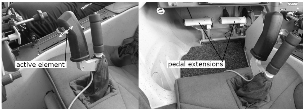
Fig. 1. Haptic feedback actuators on the control stick and the pedals.

The aircraft used for the flight test is a low-wing, single-engine, 2-seats ultralight airplane Dynamic WT-9. A pitot tube with AoA and AoS vanes was used and fixed under the wing of the airplane. The accelerometer [11] was used and fixed inside the cockpit for the flight data evaluation purposes. The control unit was based on an Arduino mega board [12] with data logger shield for flight data recording. The control unit allowed the inflight monitoring of the haptic system using LCD and changing of the haptic feedback system parameters and operation modes. All electronics parts of the control unit were enclosed in 3D printed (PLA) box. 3D printed (PLA) control stick handle includes two servomotors used for the movement of the active element. The handle was strapped to the airplane's control stick so it would not restrict any of the required movements. Each 3D printed (PLA) rudder pedal extension holds two vibration engines [13].