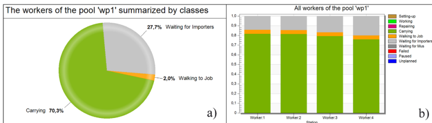
Fig. 2. Employee activity chart a) full pie chart of employee work, b) column chart of 4 employees in the modelled picking area.

To minimize unnecessary motion (waste of motion), you can apply the graphic simulation methodology for the manipulator and transporter paths described in [10] and the methodology for optimizing transport routes presented in [11] for minimize waste of transportation.