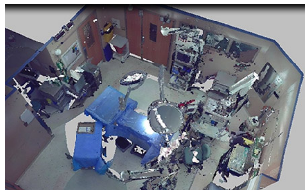
Fig. 1. Virtual crime scene reconstruction example.

the manual method to be more accurate but the software application method more precise [2]. Further, 3D scan data may be combined with CCTV or eyewitness photographs, which can for example aid with identifying the spatial position of an individual or for profiling individuals (e.g. to estimate height) [1]. For larger areas, such as open fields and rooms within a building, ground-based laser scanners are suitable (terrestrial laser scanners). These scanners use either a pulsed (time of flight) or continuous frequency modulated (phase-shift) laser that measures a distance to the surface of an object [3].