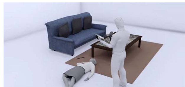
Fig. 3. Virtual crime scenario.

The issue of crime scene reconstruction has been discussed in the previous chapter but important is to define the difference between scene and scenario. The scene is a static 3D interpretation which could be observed from a variety of different angles, but it remains stable, without any movement of objects within and without any process or action is depicted. On the other hand, the scenario is the representation of process within the virtual environment which based on real area reconstruction. The possible intention of future research is utilization of connection of immersive ability of virtual scenarios and methods of scanning human physiological and psychological characteristics.