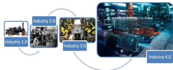
Fig. 2. Evolution of Industry 4.0

A transformation into autonomous production as shown in Fig 2 was brought very first by steam and water energy (Industry 1.0), followed by electrification (2.0), far more recently by the digital computer system (3.0). Now in Industry 4.0, organisations are positioning themselves with digitization to their end consumers using customer experience, digital marketing and e-commerce [11]. Ultimately, based on the latest technological advancements a new business model designs up by undergoing transformation in each facet of a company with integration of research and development, manufacturing, marketing & sales, and other internal operations. Virtually, driving towards a complete new digital ecosystem [12].