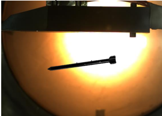
Fig.3 The picture shoot by horizontal camera

The ejection test of the embedded weapon in the 0.6 x 0.6 m transsonic wind tunnel has been carried out smoothly. The missile dropping process is shown in Fig. 4. More than 20 different state tests have been completed. The number of tests exceeds 60, including the tests of varying Ma, angle of attack, pressure and attitude of missiles. The test successfully completed the scheduled task, and all parameters met the set technical requirements. Especially, the independent and continuous adjustment of ejection velocity and angular velocity is realized, and the reliable ejection of the missile with arbitrary wind load and Ma is realized.