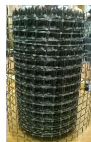
Figure 1. Basalt grids/mesh (BFRP).

cost and exhibit good resistance to chemical and high temperature exposure [5]. The ultimate strain of BFRP is higher compared to other common FRP materials based on this, it is interesting to use this advantage in column strengthening to enhance the seismic performance. Though the invent of basalt materials has been long, there is little research concerning the application of basalt fibre in civil engineering and its strengthening efficiency on concrete elements.