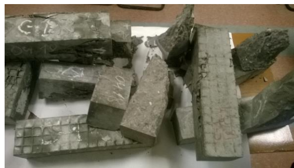
Figure 5. Rectangular columns after test

Figure 5 shows the results of the confined and unconfined rectangular after failure.