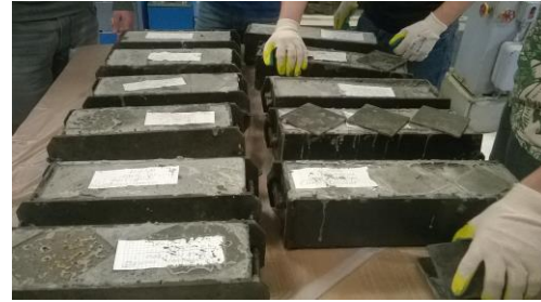
Figure 3. Rectangular columns in the forms.

Before casting, the basalt grids/mesh of Figure 1 were cut to size the rectangular form then, laid inside rectangular forms. The basalt fibre mesh was cut with lengths of 39.5cm and the three side to a length of 30cm. The 5mm gap provided for the length of the column was to prevent axial load on the BFRP jacket. As the sheets were wrapped in a continuous way, these lengths allowed for an overlap of 2cm. All specimens were axially loaded in a universal testing machine with a compressive capacity of 2500 kN under displacement control mode with a constant speed of 0,5 MPa/s. Axial load was recorded from an output signal from the test machine and the axial deformation was measured as the displacement of the loading base plate. Figure 3 shows the pictures of the rectangular columns in the forms.