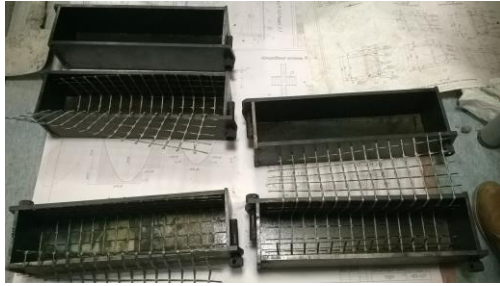
Figure 2. Lying of Basalt grids/mesh (BFRP) for confinement.

Before casting, the basalt grids/mesh of Figure 1 were cut to size the rectangular form then, laid inside rectangular forms. The basalt fibre mesh was cut with lengths of 39.5cm and the three side to a length of 30cm. The 5mm gap provided for the length of the column was to prevent axial load on the BFRP jacket. As the sheets were wrapped in a continuous way, these lengths allowed for an overlap of 2cm. All specimens were axially loaded in a universal testing machine with a compressive capacity of 2500 kN under displacement control mode with a constant speed of 0,5 MPa/s. Axial load was recorded from an output signal from the test machine and the axial deformation was measured as the displacement of the loading base plate. Figure 3 shows the pictures of the rectangular columns in the forms.