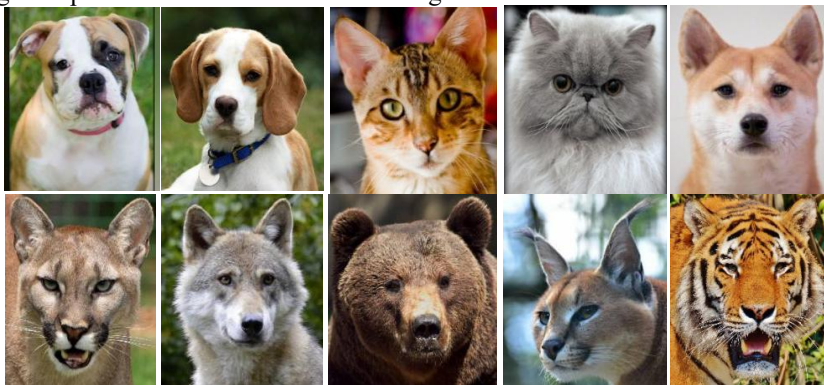
Fig. 1. Example of the dataset. The top row shows the pet animals and the bottom row shows the predator animals selected for this experiment.

In this paper, a statistical feature extraction method of predator animal face region in outdoor areas is proposed. The region descriptors are used to extract the statistical information of a specific image region of animal faces. We propose that animals' ears and eyes are used as a region for extraction of statistical information because they contain valuable features to classify the type of animal species. Researchers found a correlation between terrestrial species pupil shape and ecological niche, which is to say that, predator animals have different pupil shape than prey animals [8]. In this research we focused on extracting the features of animals eyes and ears, to determine which type of animals it belongs to. The process flow is as follows: First, a dataset was created containing images of ten animals (5 Predators, 5 Pets) The images have large variations in scale, pose and lighting. Samples of the dataset are shown in figure 1.