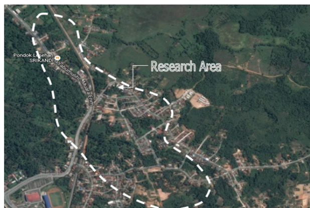
Fig. 1. The study area in the growth residential areas at Muara Enim, South Sumatra.

This research was conducted in the Residential Growth Areas at Muara Enim in the Province of South Sumatra with total areas of 82.16 hectares and a population of 2356. Three areas for the wastewater treatment plant were identified for plans based on the proximity of the water resources. Fig. 1 exhibited the research area as shown by the dotted line covering the whole areas for the Growth Residential Areas. The economic feasibility analysis was conducted by examining three indicators namely Net Present Value (NPV), Internal Rate of Return (IRR), and Benefit Cost Ratio (BCR) methods. The variables used in this research consist of land costs, construction costs, operational and maintenance costs, and revenue from users. In this study, the rates were analyzed based on the ability to pay (ATP) and willingness to pay (WTP) of the users. To examine the influences of the most significant variables, it is necessary to analyze the sensitivity of each variable by using the sensitivity analysis. The details for data collection can be seen in Fig. 2.