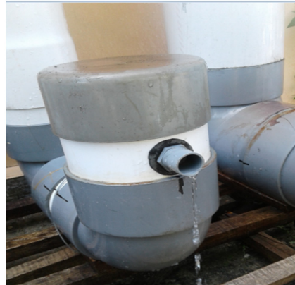
Fig. 3. Discharge after 50 hours filter usage.

Initial use of cleansing, discharge 181 liters/hour of image 2, after 50 hours of use of the cleansing, discharge decreased to 13 liters/hour of Fig. 3, no longer effective produce water required, so the filter needs to be cleaned. Model washing the filter as in Fig. 4 and 5.