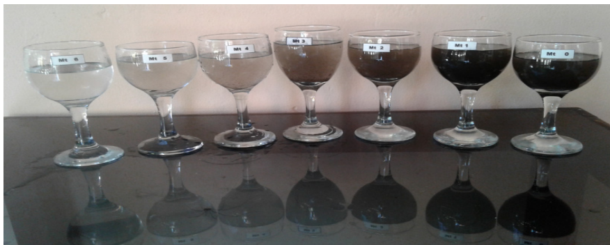
Fig. 6. The level of turbidity of the washing out water, based on the length of filter washing time.