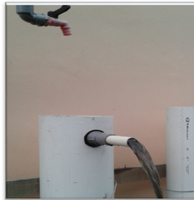
Fig. 5. Dirty water out of purification.

The washing process of a water filter, by passing pressurized water through a wash slam connected to a water tank above it to a clean water outlet pipe Fig. 4, water that flows through a layer of dirty sand, flowing out with dirt Fig. 5. The level of turbidity of the water coming out of the wash based on the length of the washing time of the filter as shown in Fig. 6. and the result is like the graph of Fig. 7.