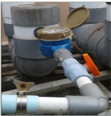
Fig. 4. Measuring discharge strainer laundering.

Initial use of cleansing, discharge 181 liters/hour of image 2, after 50 hours of use of the cleansing, discharge decreased to 13 liters/hour of Fig. 3, no longer effective produce water required, so the filter needs to be cleaned. Model washing the filter as in Fig. 4 and 5.