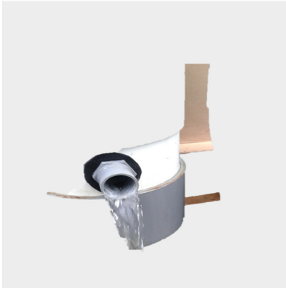
Fig. 2. Initial discharge of filter usage.

In this research, filter washed, when the initial discharge Fig. 2 increasingly decreased Fig. 3, after purification, is used more than 50 hours.