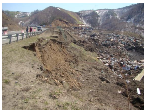
Fig. 3. Landslide in the area of the solid waste landfill in Kholmsk on the Yuzhno-Sakhalinsk-Kholmsk highway, April 2018.

Thus, dumps, various embankments and recesses, quarry are the source of landslides and mudslides.