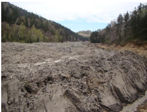
Fig. 2. Landslide deposit of technogenic soil of a dump coal producer in village Gornozavodsk, Nevelskiy district, May 14, 2018.