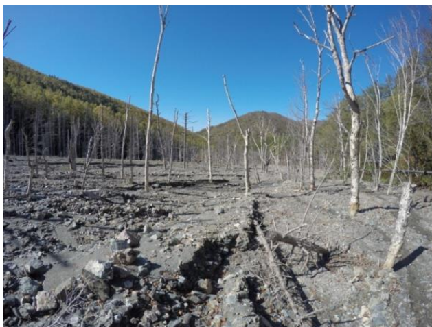
Fig. 1. Debris flow deposit of technogenic debris-flow, created from soil of a dump of a pit «Listvenichny» in river channel of tributary of the Chomutovka River, 2016.

On April 15-16, 2018, a landslide was formed on the South-West coast of Sakhalin island on the section of the Federal highway of Yuzhno-Sakhalinsk – Kholmsk in the area of the domestic waste landfill of Kholmsk. The reasons for activation - overload of the soil dump formed during the construction of the road, construction waste and household waste, as well as intensive watering of the blade during snow melting (Fig. 3).