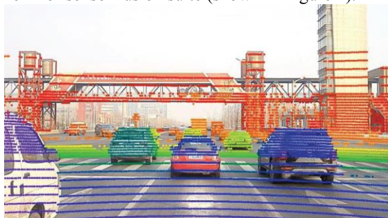
Figure 2. The effect of sensors fusion.

The environment-aware system uses vehicle sensors to detect and calculate the vehicle environment, which mainly consists of machine vision recognition system, radar system, ultrasonic sensors and infrared sensors. Machine vision has a wide range of detection and large information capacity, but it has a large amount of data to process and is widely used in the research field of intelligent vehicles. The millimeter wave radar system can obtain the target distance, speed, azimuth, etc., and the operation is in good performance of real-time, and the measurement range is far. However, there is no concrete and accurate description of the appearance of the detected object. The laser radar can just make up for the insufficiency of the millimeter-wave radar. The measurement accuracy is high and the speed range is high, but the measurement distance is relatively short. In addition, the cost of laser radar in the market is high, especially multi-line laser radar. In order to maximize the advantages of various types of sensors and cost reduction, many R&D institutions use sensor fusion solutions. For instance, HESAITECH and BAIDU Apollo released a "Lidar + camera" integrated sensor can provide multi-sensor fusion and perception algorithms, and finally in the form of sensor fusion suite (shown in Figure 2).