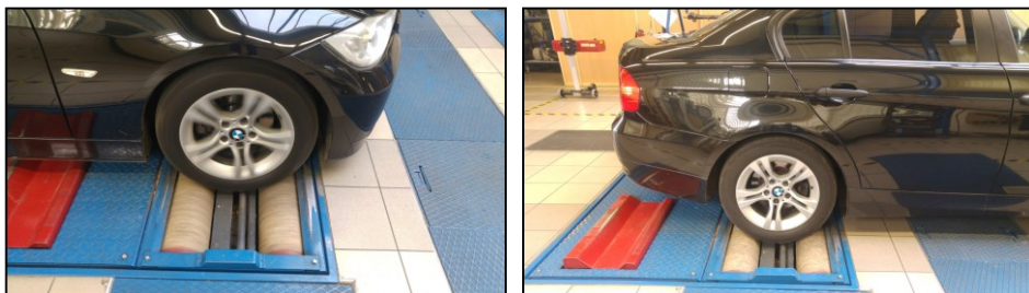
Fig. 2. Research on rolling resistance for front and rear axis of the vehicle

Before the measurements were made tire pressure had been checked. Next the car was placed on a research stand which is roller test bench. Each test was performed separately for front and rear axis. During the test the rolling resistance force for each wheel was determined as well as braking force. The research for stationary method is presented in Figure 2.