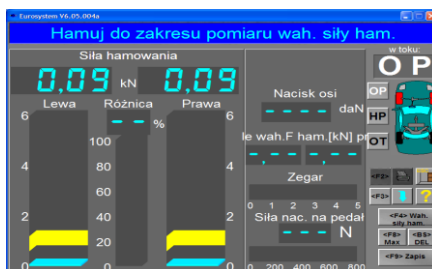
Fig. 3. Screenshot of measurement system for the rolling resistance coefficient of front axis

The measurement results of rolling resistance force of front and rear axis of a vehicle recorded during the research are presented in figures 3 and 4.