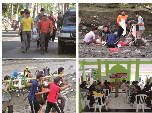
Fig. 3. Increasing capacity for response ability

Building community responsiveness has been done by ensuring the response plan, which is always up-to-date. Then, local wisdom and knowledge can be utilized as a response to the warning. Communication network within 63 villages may enable them to work well. Simulation and training activity was implemented by the community in the various village; Sempu, Sumbersari, Pondok Agung, Besowo, Candirejo, Pandansari, Ngantru, and Kepung. Those activities were held together by KAPPALA from 2009-2011 and by Nadlatul Ulama Volunteer Team in 2012 as their readiness to encounter the eruption. (Fig. 3.)