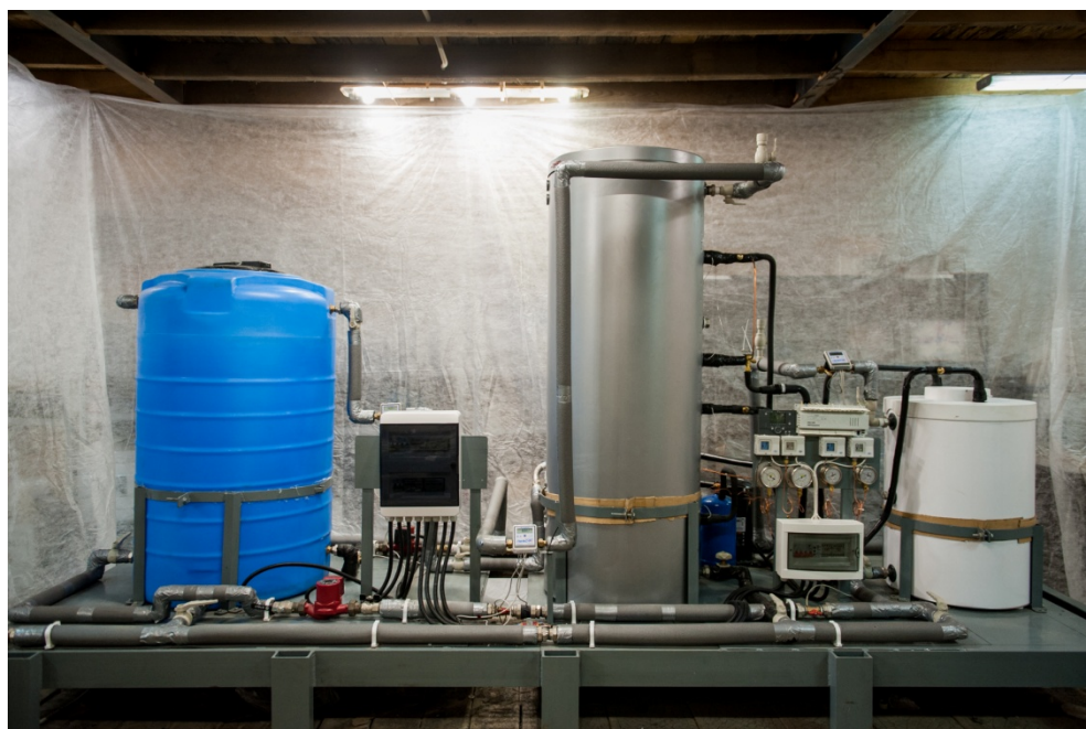
Fig. 1. The test bench of a cascade heatpump installation

[2]. Tests of multi-level battery do not cause difficulties and do not require bulky systems for their approbation, because each level has fixed temperatures. However, setting up and testing a cascade heat pump system requires larger, more complex and expensive circuits. When creating a heat and power complex, an important task is to confirm its efficient operation and high primary energy coefficient of performance in a cascade heat pump system. For approbation of all cascades the transformation warmth complex it is necessary to have all sources and receivers of the heat energy put in its thermal structure. It is also necessary to provide possibility of utilization of internal energy resources. For carrying out all complex of researches it is necessary to have opportunity upon the demand of the operator to change characteristics of sources and receivers of warmth and cold, and also operating modes of systems of heat consumption and cold. This task difficult is implemented in natural tests on real object, not to mention its cost that within financing of grant would be not real. Therefore by group of developers it was proposed the circuit solution, the providing imitation of work of heat power complex on real object. At the same time there is opportunity at any moment to change scheme parameters for imitation of different operating modes of complex from different renewable and secondary energy resources. The photo of the test bench is shown in the figure 1.