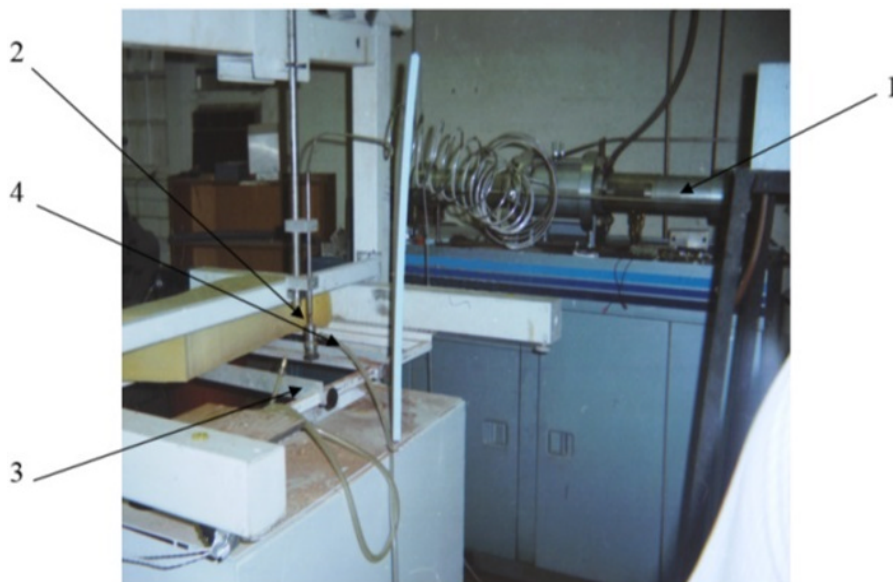
Fig. 1. Test bench.

Studies aimed at optimizing the modes of the machine parts water-ice jet cleaning were carried out on a special bench consisting of the following main units: high-pressure pump of multiplier type 1, waterjet tool 2, sliding table with brackets for holding the samples 3 (fig. 1). Pump 1 allows providing water pressure up to 100 MPa and regulates its flow rate to 30 l/min. Test specimens with different physical and mechanical properties were attached to the sliding table 3 by means of special brackets. Sliding table was driven by an electric motor with a thyristor converter and a screw drive. The supply of prepared ice particles was delivered to the waterjet tool via flexible tubing 4. To record the pressure, the first-class precision indicating pressure gauges installed at the outlet of the pumping unit were used.