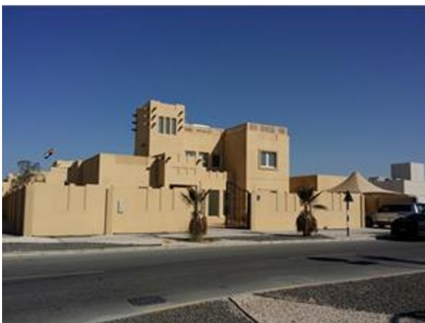
Figure 2. One of the precast concrete family houses in Al-Falah development