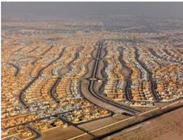
Figure 1. Site Aerial view of Al-Falah housing project.

Al Falah Community development in Abu Dhabi consists of five 'villages' presenting 4,857 villas and a range of community amenities, providing sustainable neighbourhoods serving modern needs and lifestyles whilst preserving and promoting the traditional Emirati identity and preferred style of living.