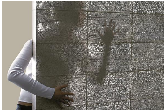
Fig. 1. Photo of LiTraCon's blocks [8].

LiTraCon includes approx 96% concrete mixture with fine grain size and 4% fiber optics. The grain size and diameter of the optical fibers have been selected to allow for correct light construction of the finished element structure. Optical fibers are arranged parallel to one another and perpendicular to the edge of a concrete block. This allows for partial light transmission. This means that applying LiTraCon you can see both the shapes and colors of objects on the other side of the material. An example of LiTraCon blocks is presented in Figure 1.