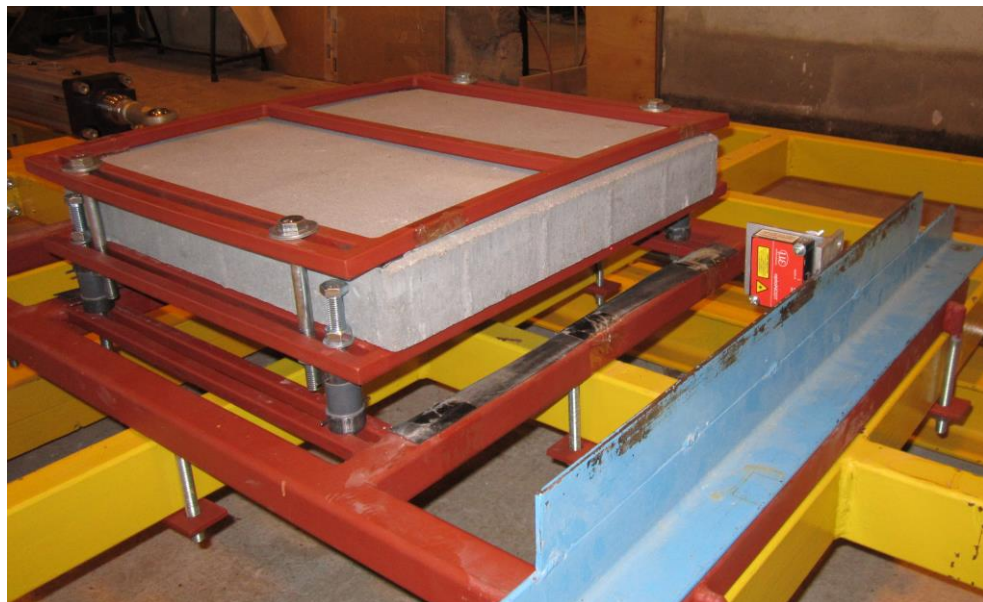
Figure 1. Concrete base slab supported by four PBs during dynamic oscillatory tests.