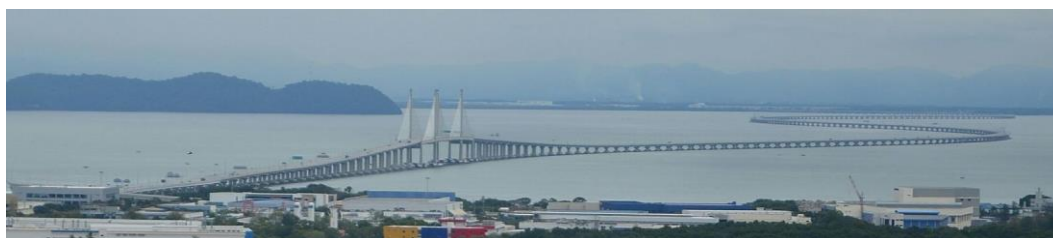
Figure1. General view of Penang Second Marine Bridge.

In the Hong Kong General Specification[2], both the installation tolerances for marine and land bored piles are given. The tolerances are 150mm and 75mm for marine and land piles respectively.