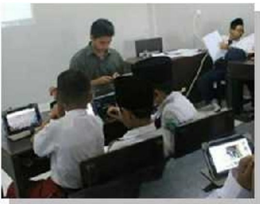
Fig. 1. Ipad preparation (checking) before learning through ipad learning media.

"In Islamic education learning I usually teach with methods that are often used, namely lectures, question and answer, discussions, presentations and so on. From these methods then I combine them with ipad learning media or here commonly called one teacher one tab and one student one tab. But I also adjust to the material I teach, because the use of learning media if it is not adapted to the material will also be in vain. The application of Ipad Learning learning media that I did in class with the following procedure: I set the goal of teaching using learning media, in this step formulating the objectives to be achieved. Then, I prepare the media that will be used, namely ipad learning, before learning I check the material to be taught on the ipad that will be used. Furthermore, students are given directions in advance to be able to use the media to be used namely the ipad. After that the presentation of lessons and demonstrations. There are several forms, some in the form of ibook, in which there are books in the form of files that have been stored on the iPad, there are power point slides, or in the form of videos related to the subject matter. After the preparations are completed, the learning activities are completed. The steps are in accordance with the RPP I made. Then the last step of the lesson evaluation " (Khoiriyyah, August, 2017).