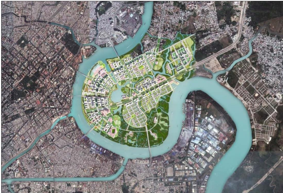
Fig. 1. Map comparison method (to analyze the relationship between urban layout between Thu Thiem and HCM historic center), historical and logical method, and Analysis- synthesis- systematization.