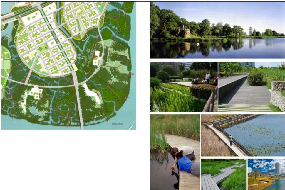
Fig. 4. The central HCMC.

While the river element has been significantly damaged in urban development in the existing center, the dynamic linking of the delta's natural signature to the urban space of Thu Thiem is an opportunity to consolidate strong identity, the uniquenessof the central HCMC compared to other cities, both domestically and internationally [5,10].