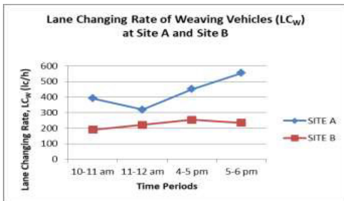
Figure 4. Graph of lane-changing rate of weaving vehicles at sites.

The final finding of this study found that the total lane-changing of both weaving and non-weaving vehicles were absolutely occurred during peak hours and the highest rate recorded at Site A with 1142 lc/h while Site B is 812 lc/h. This number shows in Table 5 and Figure 5. It also explained that Site A has more tendencies to encounter weaving turbulence due to high lane-changing activity. The high total lane-changing activity somehow affected by a lot of weaving vehicles crossing over the direct traffic. In term of operational, Site B is better than Site A because smooth traffic movement occurred at here. Meanwhile in term of safety, Site B is worse than Site A due to high risk of collision because of shorter weaving length.