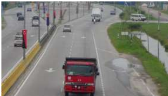
Figure 1 Site A; Federal Road FT050 KM15