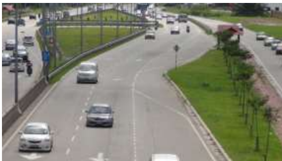
Figure 2 Site B; Federal Road FT050 KM16

Besides, investigation of maximum weaving length was made by using Chapter 12 in HCM 2010 since the value of L_{MAX} for both sections was greater than L_S . Hence, both sites could be analyzed as weaving section. The analysis found that Site A has more tendencies to encounter weaving turbulence since the value of maximum weaving length is ranging from (1952 m – 2120 m) while Site B is ranging from (1866 m - 1882 m). This means that the impact of weaving turbulence at Site A could be felt as far as 168 m meanwhile impact of weaving turbulence at Site B could be felt as far as only 16 m. In term of operational, Site A is worse than Site B. Table 3 and Figure 3 summarize this finding for both sites.