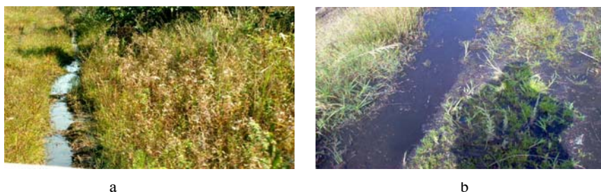
Fig. 1. Infiltration through dikes, a - Lake 1, b - Lake 2.

The values mentioned in Table 4 were determined by the National Authority "Apele Romane - Cris", in collaboration with the Environmental Protection Inspectorate Bihor. Consequently, the development of the hydropower system realized along the river Crisul Repede has been finished with the construction of 7 hydropower plants with an installed power of 208 MW, 5 dams, and over 34 km of main and secondary headrace. The dam's realization was accomplished in '80, followed shortly by infiltration through dikes. In Figure 1 are presented the appeared infiltration.