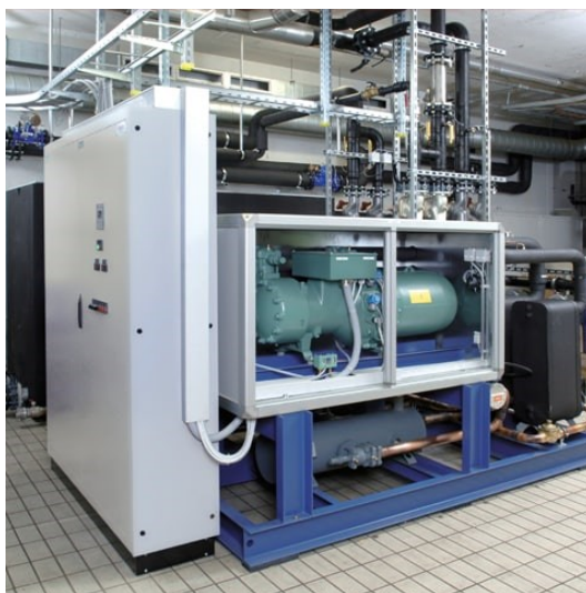
Fig. 1. Industrial heat pump with a capacity of 1.45 MW.

The proposed technology for the use of geothermal power of mine water consists of a set of 7 water/water heat pumps with partial output of 1.45 MW connected in a cascade. The circulation of the refrigerant is provided by semi-hermetic piston compressors to achieve a high output heating water temperature (65 to 80 °C). The heating system of the heating water by means of a heat pump is designed as a two-exchanger because of the extraordinary aggressiveness of the mine water. The primary water/water heat exchanger passes the thermal energy of pumped mineral water to the heat transfer medium that conveys it to the heat pump. The water heated in the heat pump at about 65 °C then passes the heat energy into the secondary heat exchanger to the heating water. The water parameters at the heat pump input are given by the temperature of the mine water reduced by the temperature gradient in the separating exchangers.