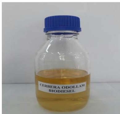
Fig. 3 Cerbera odollam biodiesel