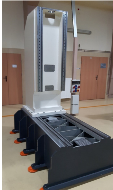
Fig. 5. The CNC milling machine frame after seasoning, vibrating and machining

Using stress relieving vibration results in an advantageous reduction of peak stresses in the welds that are decisive to their fatigue strength – Fig. 5.