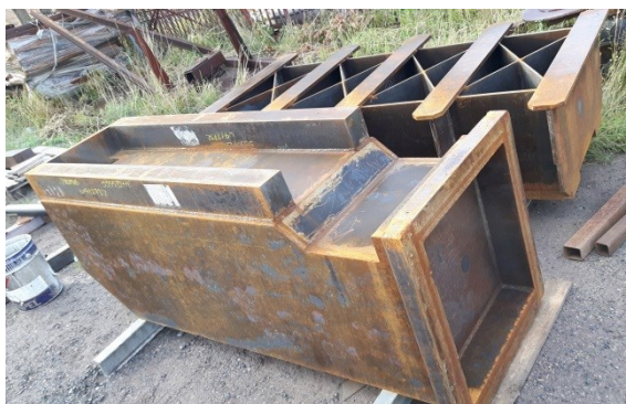
Fig. 4. Machine tool pillars and bases during seasoning

The frame was constructed of enhanced-strength steel S355J2. It was made by the MAG method employing the following welding parameters: current intensity – welding currents, 280 - 290 A; voltage, 26V; 1.2 mm-diameter wire in grade G4Si1. V and X-type grooves were designed for making welds, depending on the access to them. In the future, for similar solutions, robotized welding with off-line programming assisting can be used [18]. If further design and technological changes are made, it will be possible to reduce the mass by employing other welded materials [19] and more accurate weld dimensioning [20]. The analysis of the above-mentioned activities and the industrial implementation of the frame under discussion may lead to further engineering & design changes, similarly as for the nodes described in work [21].