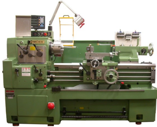
Fig. 1. A conventional machine tool

Contemporary CNC machine tools differ significantly from conventional machine tools – Fig. 1.