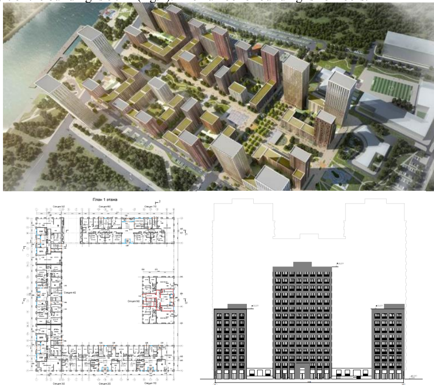
Fig. 1. Object of study

The object of the study is Section No. 8/2 of the residential complex located in the south-east of Moscow. The projected complex is a group of residential buildings. The height of the building is 50 m (fig.1). The number of building is 15 floors.