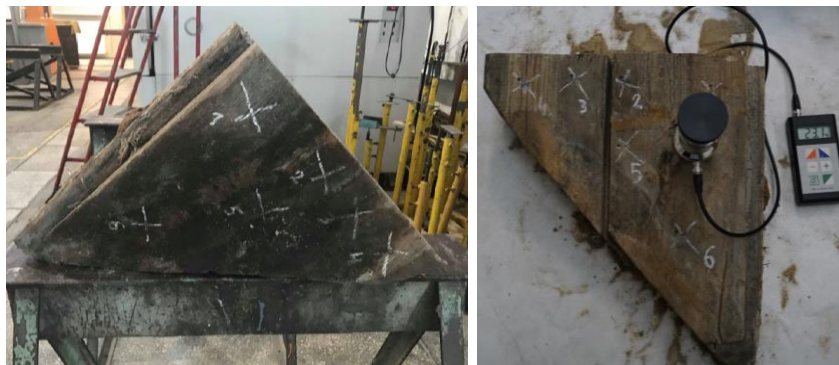
Fig. 3. Element nr 2 with measure points location (left), moisture content measuring (right).