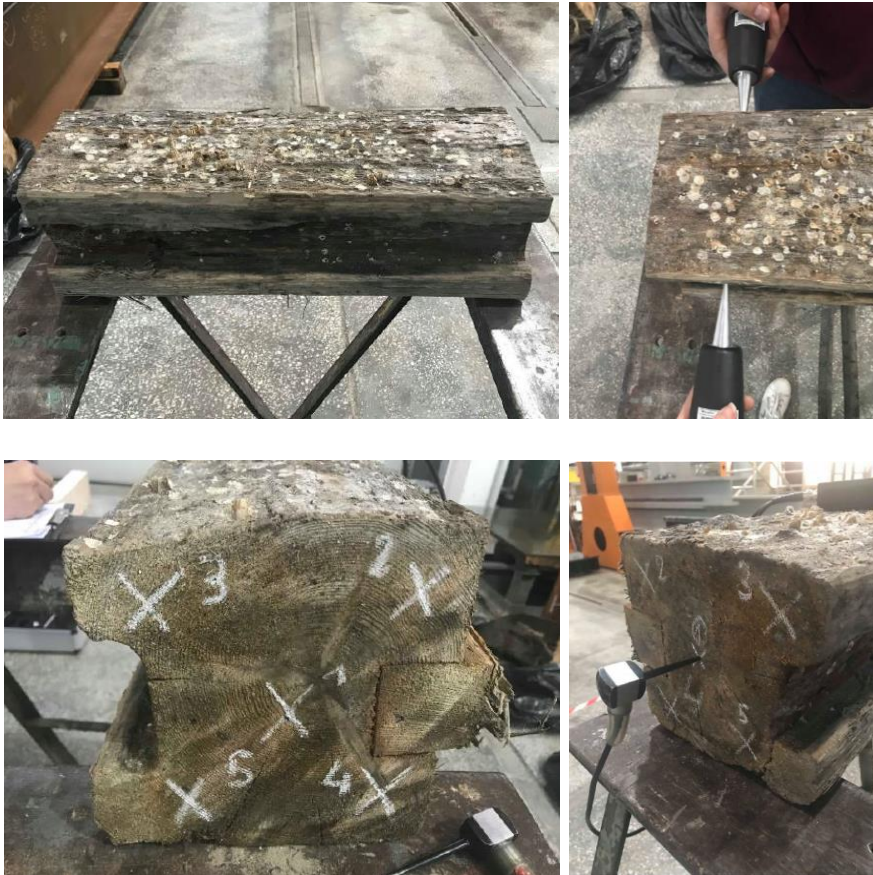
Fig. 2. Element nr 1 (top left), measure points location (bottom left), Sylvatest Trio measuring (top right), Fakopp Microsecond Timer measuring (bottom right).

The Sylvatest Trio and Fakopp Microsecond Timer devices, presented in Point 2, were used for non-destructive tests on timber elements from construction of the port quay. Three elements of the structure (Fig. 2 – 4) were taken from the construction and transported to the laboratory of Wroclaw University of Technology to be tested. Besides acoustic tests, the moisture content was measured using a FMW moisture meter (resistance type with a hammer probe). Elements were tested two times: every time with different moisture content to examine how this can affect the velocity of wave propagation.