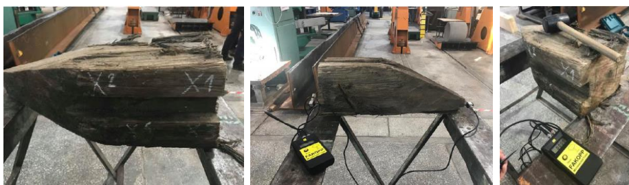
Fig. 4. Element nr 3 with measure points location (left), Fakopp Microsecond Timer measuring (middle and right).