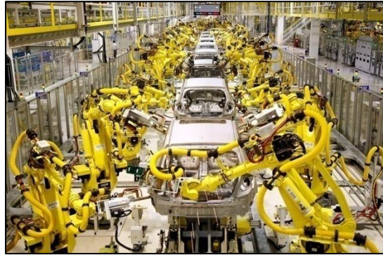
Fig. 1. Example of unmanned assembly line [4].

area are adequate for the new conditions. Below, narrower (but not less important) problem in the field of safety is discussed: if current regulations concerning explosion safety are adequate for the new conditions.