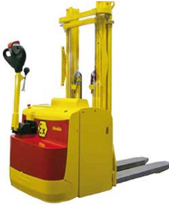
Fig. 3. Drawbar high lift truck EXI 16 for explosion hazard zones 1 and 21 (performance according to [30]) [31].

However, all the features are (or will be) achieved with use of known, existing at present technical equipment. That equipment, if designed for work in areas with potentially explosive atmospheres have to fulfill requirements of [27, 8] (e.g. Fig. 3, below).