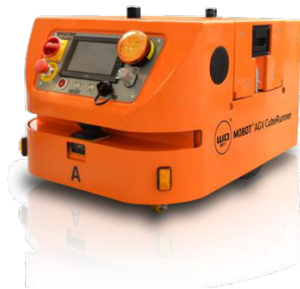
Fig. 4. Mobile robot MOBOT® AGV CubeRunner (at present: performance for conditions without explosion hazard) [32].

‘Smart factory’ of Industry 4.0 also have to be explosion safe for its workers – even if they are autonomous robots. Of course, in case of explosion in unmanned plant there will be no problem of human losses (probably regulations of [8] will not be so important), but the problem of material losses remains (and the material losses in such a case could be more severe than in a ‘typical’ plant). So, the equipment for ‘smart factory’, where explosion hazard zones are expected or assessed, have to fulfill the same requirements as for ‘typical’ plant with explosion hazard zones. The system of regulations and standards in this area of safety exists and works properly, and hopefully there is no need for establishing new rules or new standards – new equipment (e.g. MOBOT® in Fig. 4, below) have to be designed, constructed, certificated, and finally – used according to [27].