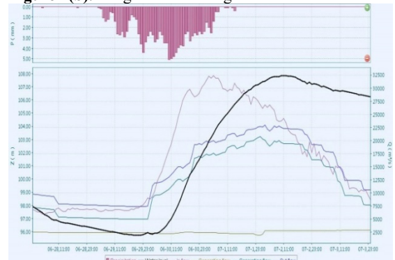
Figure 2(d). Integrated water regime of Wuqiangxi reservoir