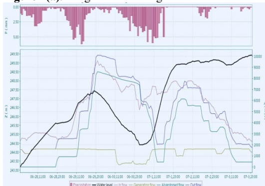
Figure 2(c). Integrated water regime of Tuokou reservoir