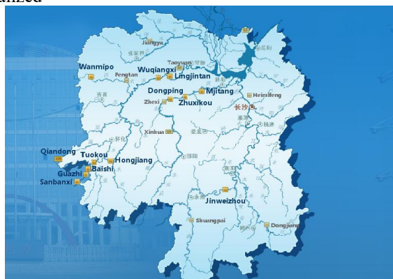
Figure 1. Wuling hydropower plant distribution

With sustainable management innovation, Wuling creates a new power generation dispatch and control mode so as to set up a Remote Dispatching Center. All its 12 hydropower plants (Figure 1) are of remote centralized