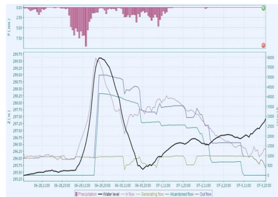
Figure 2(b). Integrated water regime of Baishi reservoir