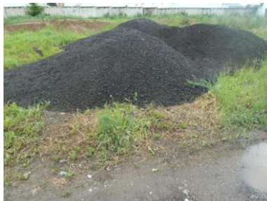
Fig. 4. Ready asphalt granulate

Currently, the United States, England, Germany and France, Japan, and Czech Republic reuse asphalt concrete (Fig. 4), it is relevant in the repair of the pavements, due to the sharp increase in prices for bitumen and other components of asphalt concrete. Regeneration at an asphalt concrete plant saves money and materials by 15-20%.