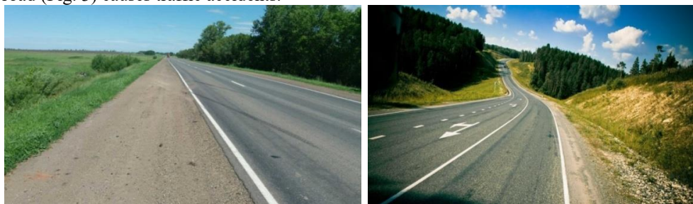
Fig. 2. The use of roadsides for the movement of vehicles in Kazan

10-15 cm excess of the edge of the roadway above the curb surface in the repair of the road (Fig. 3) causes traffic accidents.