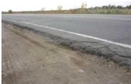
Fig. 3. The excess of the edge of the road pavement over the curb