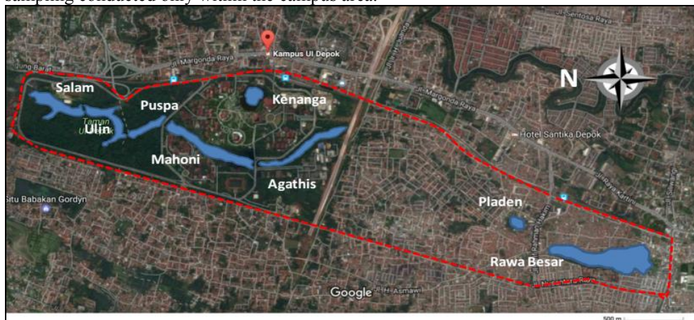
Fig. 1. Location of the study [4]

The research site is the cascade-pond system at Universitas Indonesia, Depok, West Java (Fig.1). The samples were taken in each inlet, middle and outlet of each pond. In this study, Rawa Besar Pond and Pladen Pond not included to futher analysis, because we the sampling conducted only within the campus area.