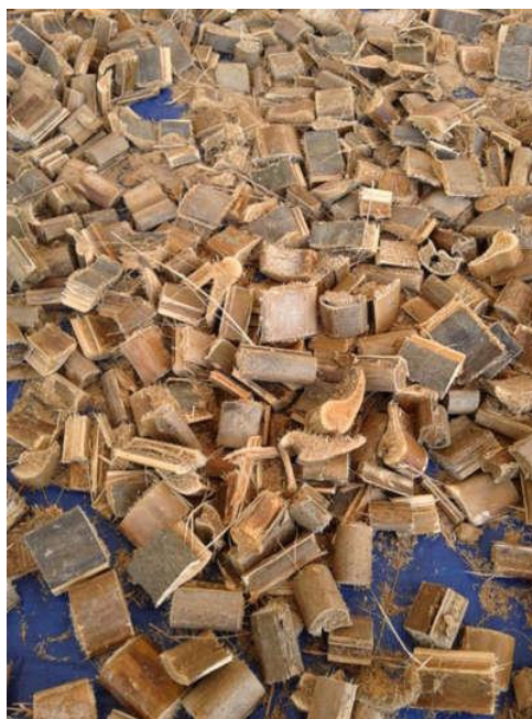
Fig 1. OPF blocks

The sections were then further reduced into blocks of 2.5\pm 0.5 cm in length using a machete, producing small blocks as shown in Fig. 1. The blocks were sun-dried at ambient conditions for 7 days to slowly and naturally remove the excess moisture content trapped within. The blocks were then artificially dried at 105\pm 0.5^\circ\text{C} in a convection oven for 24 hours to further remove all remaining moisture and to obtain the equilibrium moisture content value for OPF blocks by weight difference.