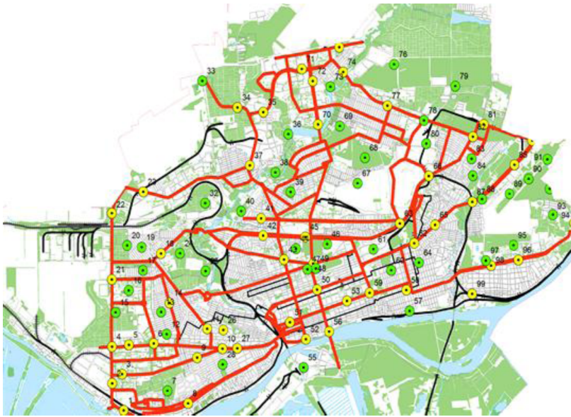
Fig. 2. Map of main noise sources

On the second stage, the actual noise levels were determined at the selected points. Based on the results of the experiment, a map of noise pollution density of the Rostov-on-Don city territory was created in the ArcGIS ESRI environment (see Fig. 3).