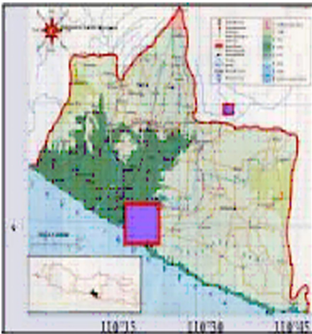
Fig.1. Parangtritis Topographic Map

Parangtritis is located on the topographic map sheets 47/XLIII-c, sheet 47/XLII-c and sheet 47 / XLII-b, with a map 1:25,000 scale. Administratively it is located between 8° South Latitude and 110° East Longitude. The study area is in the Mancingan, Kretek District, Bantul (see fig.1).