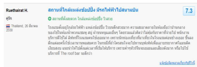
Figure 2. Thai reviews from agoda.com/th-th.

We collected a total of 3,000 hotel reviews for English and Thai from the two well-known websites TripAdvisor a and Agoda b between January and March 2015. We had an equally sized set for each languages (1500 reviews each). The data was collected with the tool import.io c , and free web site scraping tool, to transform the review pages into text. A domain expert then assigned the text to the five categories Room, Location, Service, Price, and Facilities where each was labelled as a class of polarity (Positive and Negative). Then we manual separate and labelled polarity from each reviews into five categories: Room, Location, Service, Facilities, and Price. All reviews are labelled as a class of polarity (Positive and Negative) by experts. Data is spitted into three sets of training, validating and testing with 60%, 20% and 20% respectively. Then three classifier were tested based-on the same data in order to compare the performance in terms of accuracy. Fig. 2 and Fig. 3 show an example of Thai reviews and English reviews respectively.