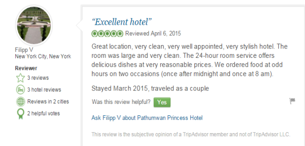
Figure 3. English reviews from Tripadvisor.