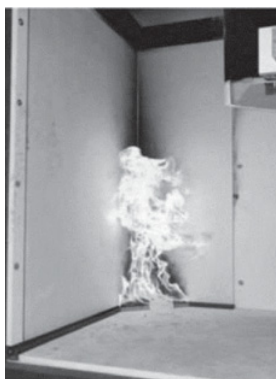
Figure 8. SBI test.

These tests confirmed that horizontal fire barriers at each level fully play their role and no additional protections on openings are needed.