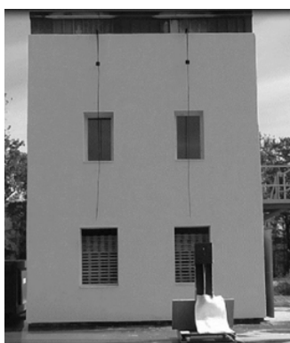
Figure 1. Frontal view of a LEPiR 2 test facility.

therefore representative of real constructions. The fire is fed with two important sources, representing a total load of 600 kg of calibrated wood.