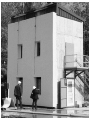
Figure 2. Three quarters view of a LEPiR 2 test facility.