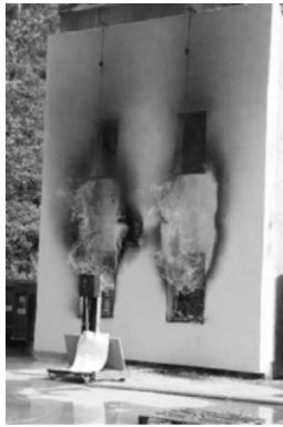
Figure 6. Observation at 20 min.