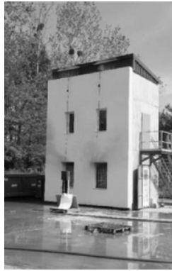
Figure 4. Observation at 1 min.