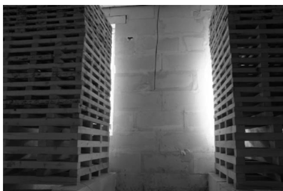
Figure 3. Fire source implantation at the lower level.