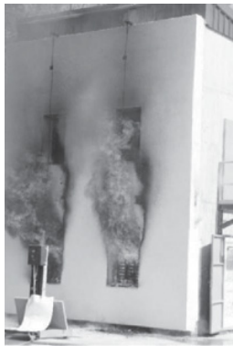
Figure 5. Observation at 10 min.