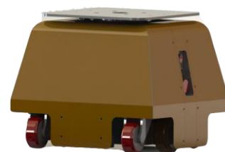
Figure 2: The structure design of AGV

Based on this mode as well as the parameters requirements of AGV, structure design renderings of AGV is shown in fig. 2. Fig. 3 shows the schematic diagram of shelves.