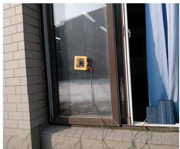
Fig. 3 wireless remote control solar cleaner prototype

When the cleaner is walking on glass, cleaning cloth can wipe off the dust on the glass. Figure 3 shows a wireless remote control solar cleaner prototype walking on the windows of the working drawing.